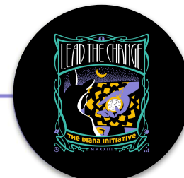
2023: Lead the Change