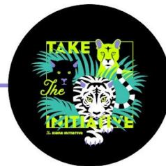
2022: Take the Initiative