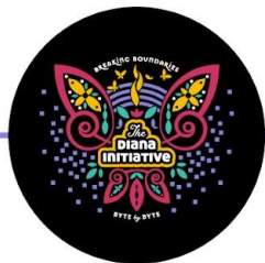
2020: Breaking Boundaries Byte by Byte