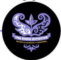
2019: Believe & Achieve Together

Last year's event, 2023 was in-person and for the first time has multiple classroom-style workshops for attendees, such as Reverse Engineering and exploiting Active Directory!