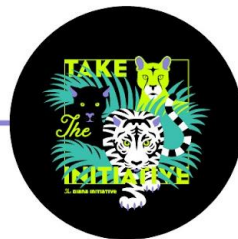
2022: Take the Initiative