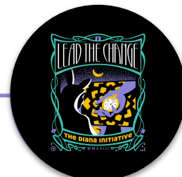
2023: Lead the Change